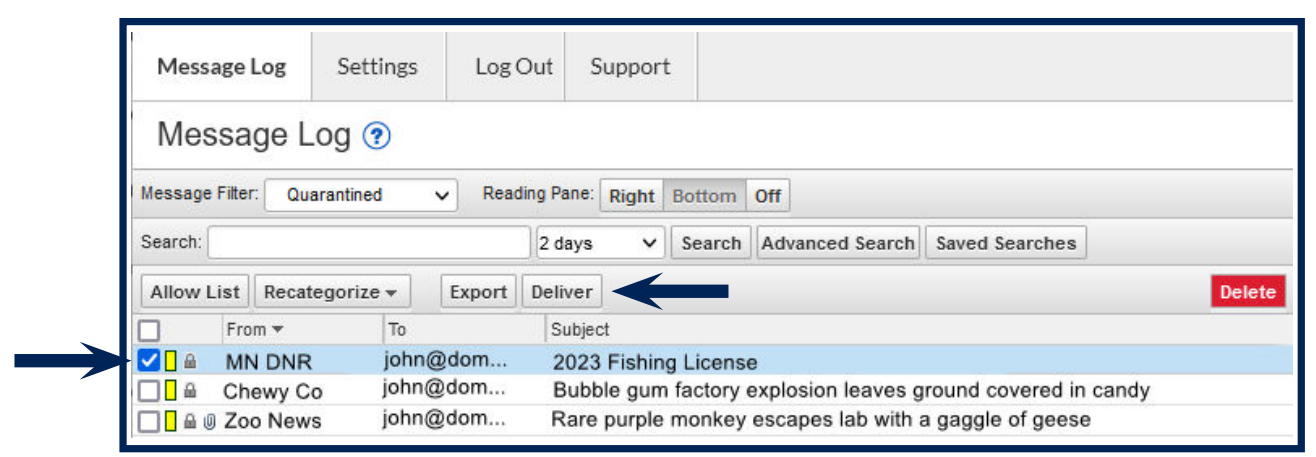
Example: This is showing what the message logo portal looks like.

Once you locate the message you are looking for, check the box and click "Deliver" to have the message sent to your inbox. You can also click "Allow List" to have the sender whitelisted for future messages. Whitelisting allows future email to go directly to your inbox.